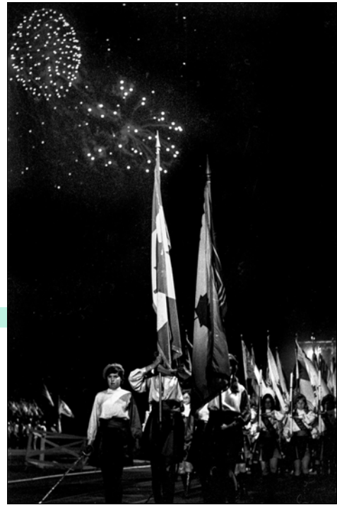
1971: Scarborough Firefighters (CNE)

Some established contests would remain unaffected by this situation, usually those that were international in composition. Such affairs mostly used dual judges associations, disputes in one of them being papered over for the duration. But they are, of course, still there.