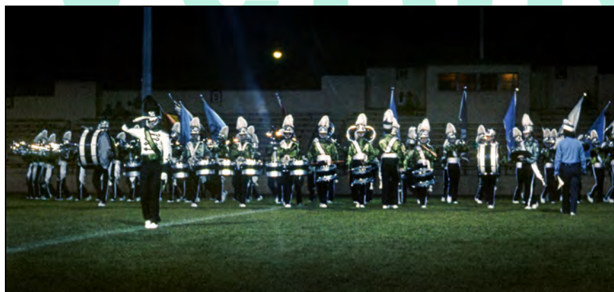
1971: Toronto Optimists