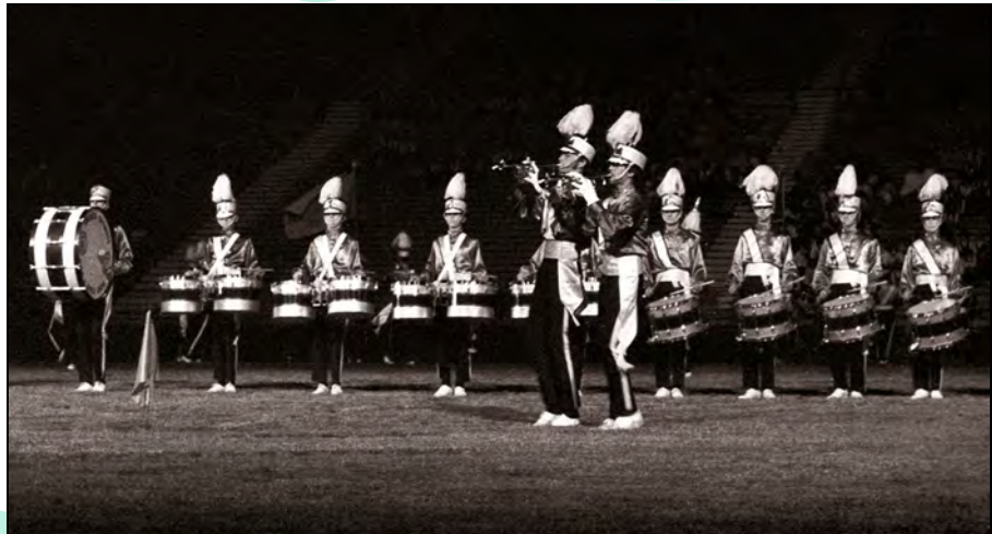
1971: Toronto Optimists

This, to all intents and purposes, was the end of the Canadian Drum Corps season. It had seen the Optimists hit their lowest point ever. It had also seen them pull themselves up to within four points of the De La Salle powerhouse during the course of the year. If ambitions and hopes remained unfulfilled, at least the progress made was encouraging. The Corps