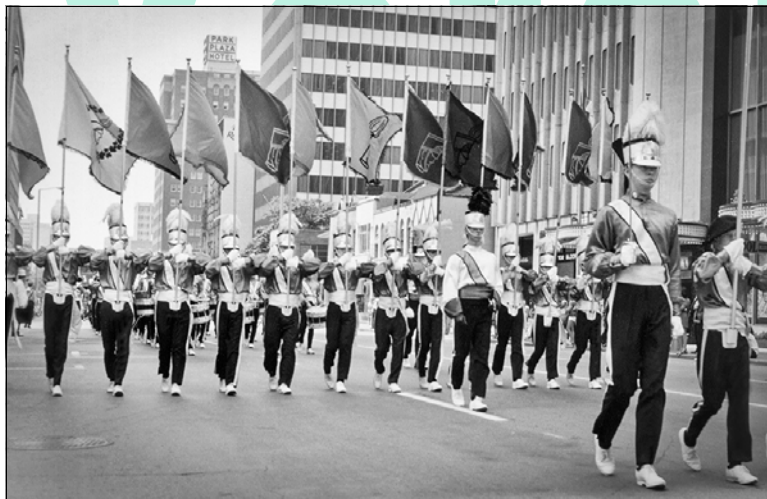
1971: Toronto Optimists on parade

The first evidence of this strange scene appeared at the now familiar Individuals Contest. There were two sets of competitors, producing two sets of results. One set was under the auspices of the C.D.C.A., the other was unofficial, as were the results. The Canadian Junior Drum Corps movement was split, not down the middle, but indisputably divided.