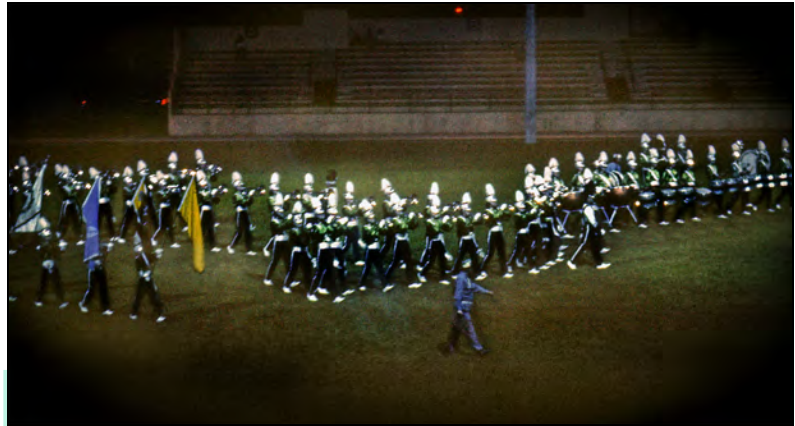
1971: Toronto Optimists

On August 2nd the same factors appeared, at the Alhambra Invitational Parade and Contest. Another top-notch line-up with eleven Corps, it was won by the 27th Lancers. A strong second was De La Salle. They were now doing what had only been rarely done before, beating top American Corps, in this case, the Boston Crusaders. On a positive note, from our perspective, the Optimists were considered the surprise Corps of the evening. The surprise was that after a terrible start to the season, they were finally starting to improve, showing potential.