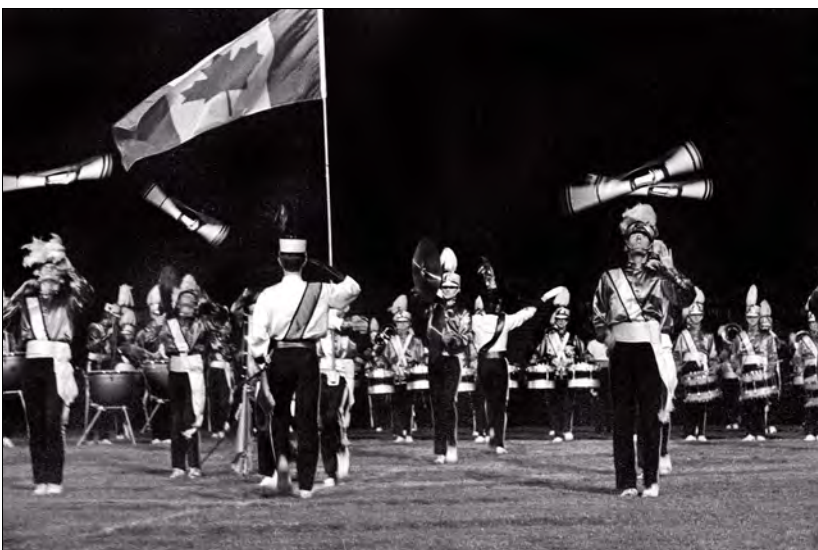
1971: Toronto Optimists (CNE)

Four of these units were, of course, the four that had resigned from the C.D.C.A. earlier this year. Because of this, they could not participate in the C.D.C.A. Championship, which always had been, and would be, the true Canadian title. So, although this would be thought by many to be the championship, it could not, and would not, be one.