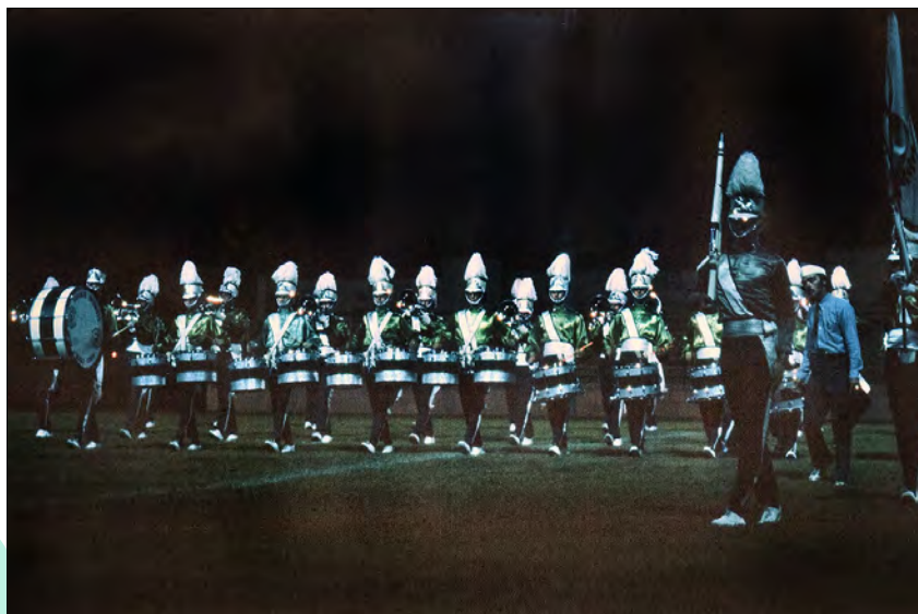
1971: Toronto Optimists

The Ontario Provincial Championship was held on August 21st, two weeks after the “Canadian Open Junior “A” Championships, a reversal of decades old form. This was followed one week later by the “Showcase of Champions”, featuring nine Canadian and one American Corps. Held at the CNE Stadium, it was a good show with all the Corps at, or near, their peak form. It was a pageant, not a contest, so no titles or championships were awarded.