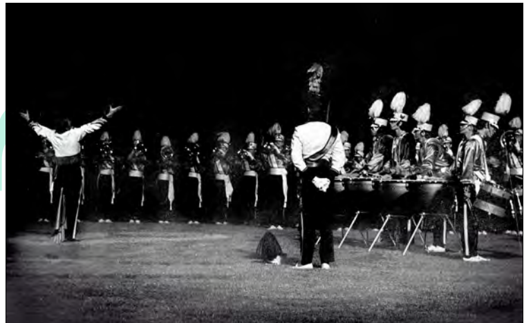
1971: Toronto Optimists (CNE Invitational)

The next big contest, the Canadian National Invitational Championship Contest, was, again, won by De La Salle. For the Optimists, though, this was a landmark, as they were only 4.2 behind Del. A big change compared to the fourteen-point spread of earlier times. It was at this show that the new, improved Optimists recorded their first win over the La Salle Cadets. They had not beaten them for quite a while. It was not that La Salle was down. It was because the Optimists were coming up.