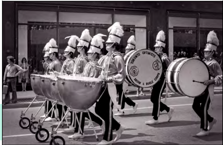
1971: Toronto Optimists in a parade with tymps on wheels

It was, however, too late this year for any good to be done. The four Corps were out and events would proceed without them. Officially, that is.