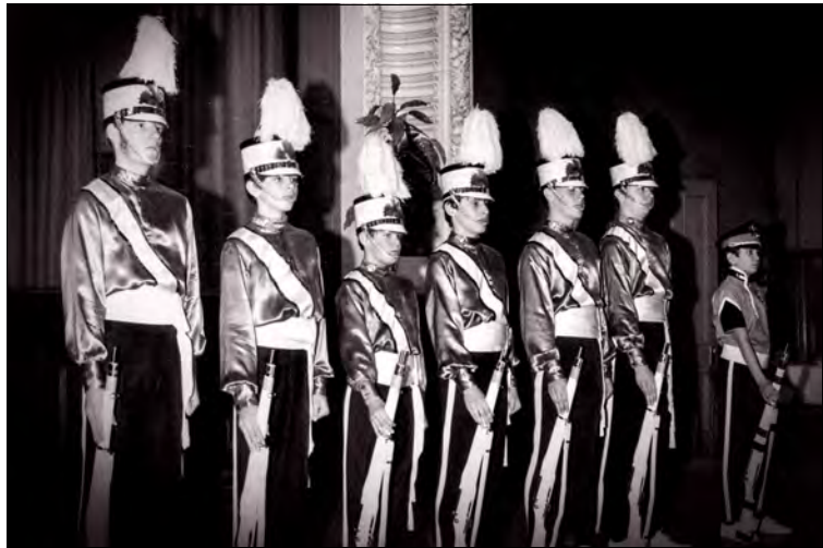
1971: Toronto Optimists rifles

economic reasons. His enthusiasm seldom flagged and, if it did, not for long. He was one of the original Drum Corps “nuts”, one of those who would always talk Corps before, during, and after rehearsals. In this respect, he had lots of company. If his personal life suffered due to this, it was not generally known. In his younger days, he was almost “one of the boys” associating with, even sometimes living with, Corps members. Many people were given opportunities to instruct, some even to arrange, but he always remained