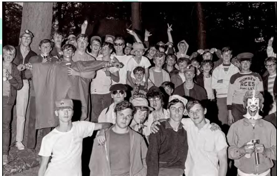
1971: Toronto Optimists initiations

As the Optimists left on July 14th for Michigan, De La Salle took off for the Eastern seaboard, and three big contests. Their constant exposure to top-flight competition would bear dividends. A contest on July 24th demonstrated this. Called “Scarborough Fair”, De La Salle cruised to an easy victory; however, an interesting highlight was reported that the Optimists had showed improvement.