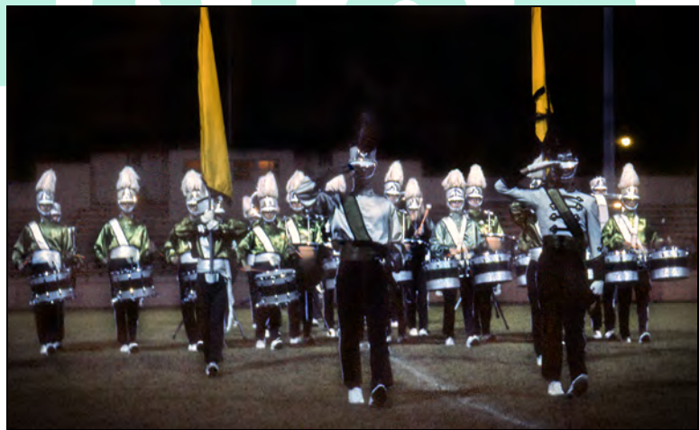
1971: Toronto Optimists

This development can be looked at in two ways. Either it was the Optimists’ way of keeping abreast of the times, this being the age of Women’s Liberation, or it was simply the lack of enough boys being interested in order to fill the necessary need. One is tempted to suspect the latter but, whatever the reason, it would turn out to be nothing but beneficial.