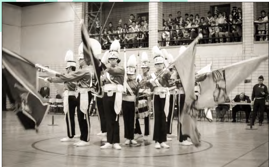
1971: Toronto Optimists colour guard in competition (St. Mike’s)

One week prior to this, Toronto’s only Colour Guard Contest took place. At this contest the Optimist guard placed second, behind the New York Squires. The girls, all new, had done well.