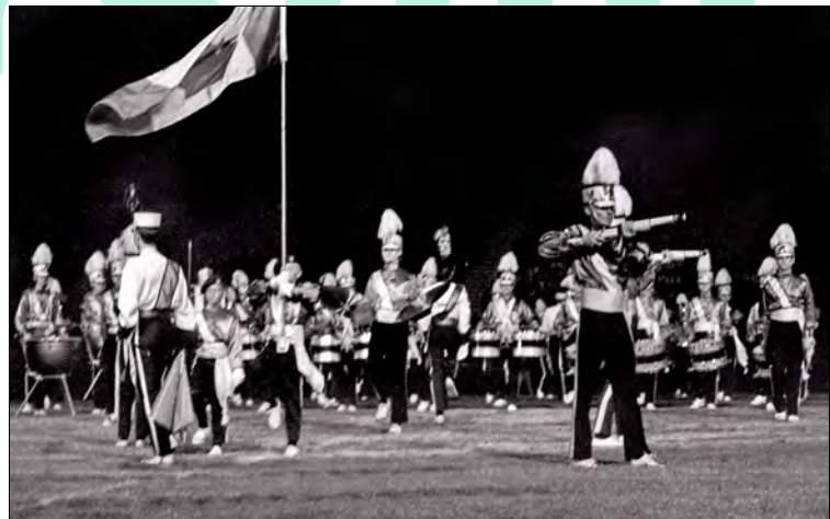
1971: Toronto Optimists (Shriners)

In the past, the Optimists often had done well at this show, even though such shows had been dominated by American Corps.